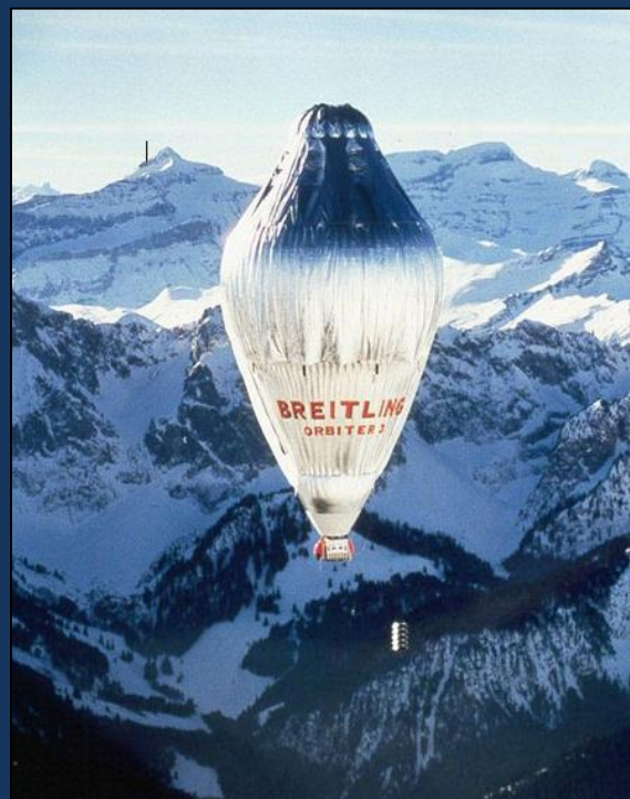
Figure 3. The Breitling Orbiter 3, built by Cameron Balloons, was the first balloon to circumnavigate the world non-stop. It was piloted by Brian Jones and Bertrand Piccard. 23

After resourcing required components, it is conceivable both the construction and deployment of balloon(s) could escape all notice. According to Baird, the area required to manufacture and launch a balloon is small. 21 With respect to radar signatures, Jones believes net-balloons would be almost impossible to see while high-altitude balloons like Breitling Orbiter 3 may have a signature. 22